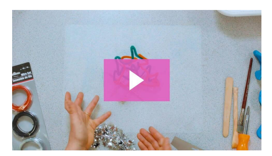
Beginning Sculpture - The Art of Education University

Creating a culture of artistic collecting is a big part of maintaining a thriving found object sculpture area. It's also an important way to keep students engaged in the artmaking process outside of the classroom.